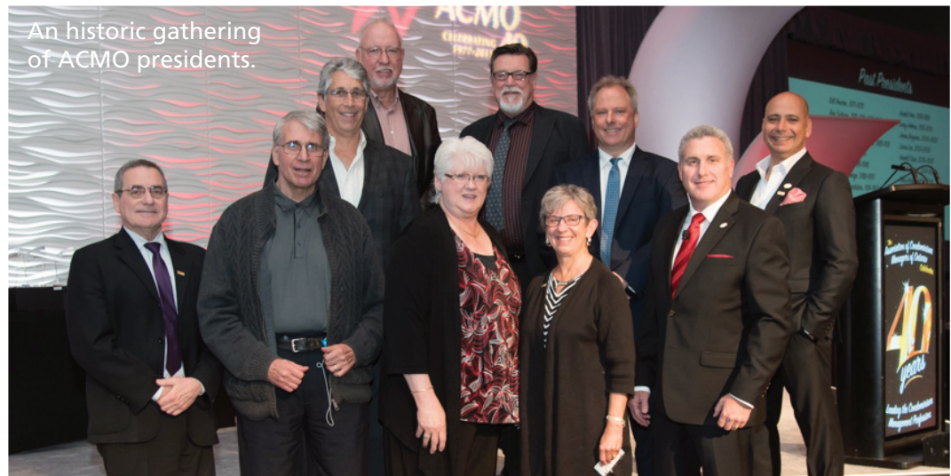
An historic gathering of ACMO presidents.