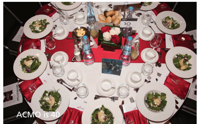
ACMO is 40